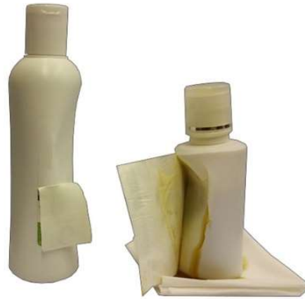
Other Brand Aroma Essence

Our aromatic resistant bottles are ideal to contain the aroma essence and come with foil sealed caps to prevent spillages and avoid degradation and oxidation of it's content.